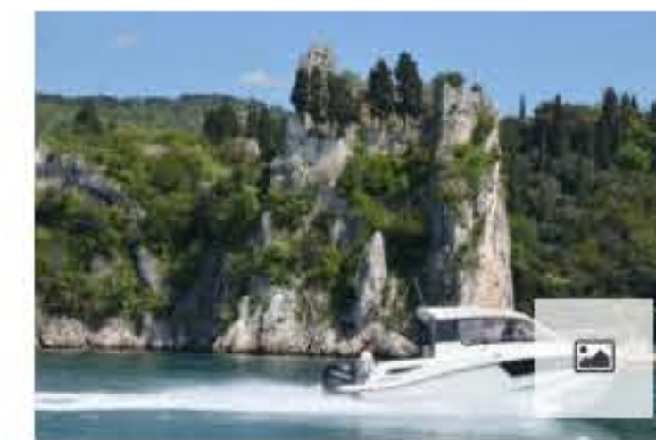
Quicksilver Activ 755 Weekend, a boat for the whole year