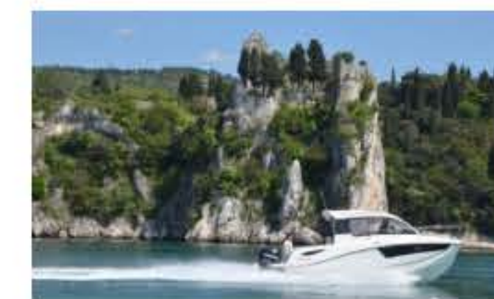
Quicksilver Activ 755 Weekend, a boat for the whole year