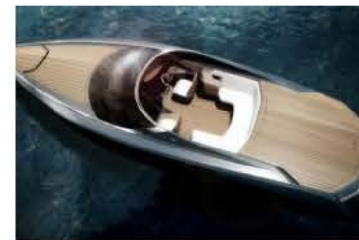
AM37 is the first boat to carry the Aston Martin name