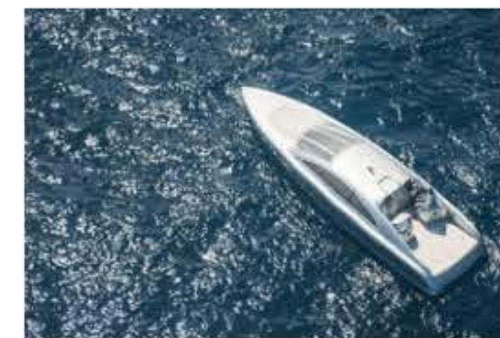
Silver Arrows 460 granturismo: the mercedes -benz of the water is ready